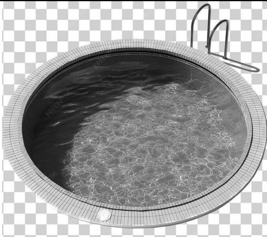
DIMENSIONS OF SWIMMING POOL